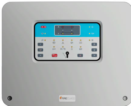
Figure 2: FireClass Essential 4 Zone Panel