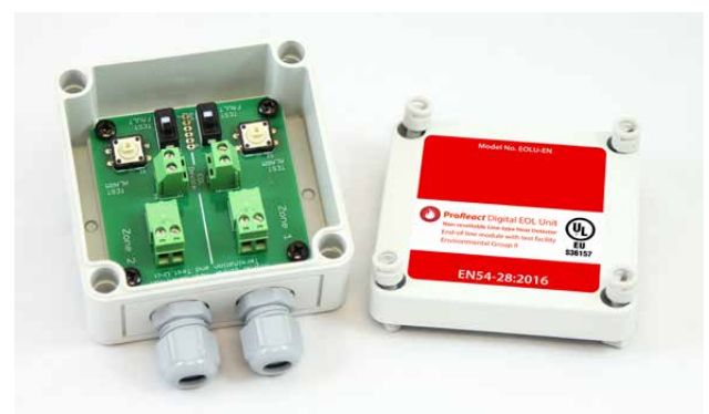
ProReact Digital End-of-line Unit (EOLU-EN)

Furthermore, the built-in switches for testing a fault and alarm condition allow the integrity of the whole system to be functionally checked in situ, providing comprehensive testing and maintenance of the system.