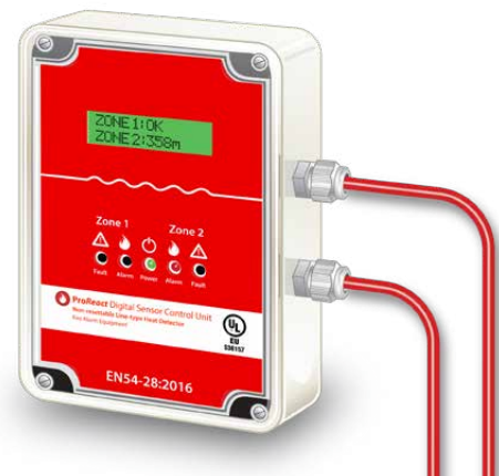
ProReact Digital Sensor Control Unit (DSCU-EN)

Furthermore, an RS-485 Modbus RTU/ASCII output is available as standard for integration with a PLC or SCADA system.