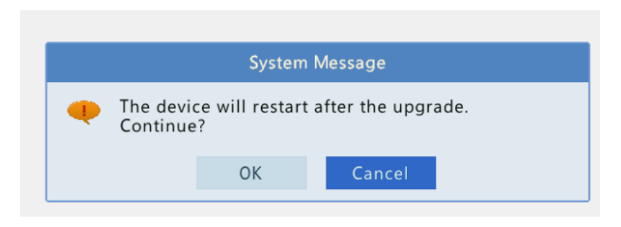
Figure 1 Prompt Message

(6) The NVR will restart automatically when the upgrade is completed.